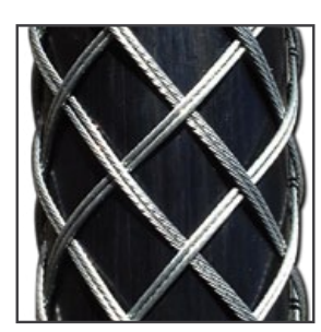
(2-layered / standard)