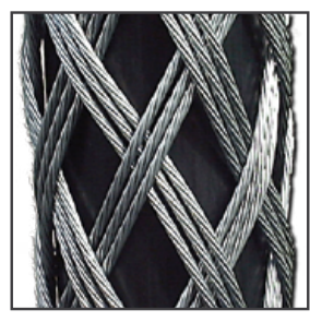
(3-layered / enhanced)