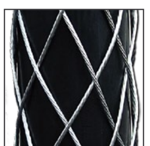
(1-layered / standard)