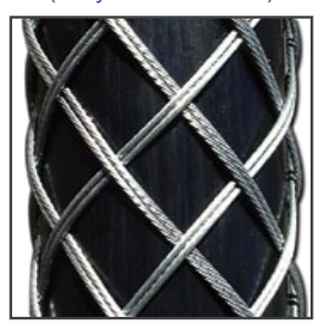
(2-layered / enhanced)